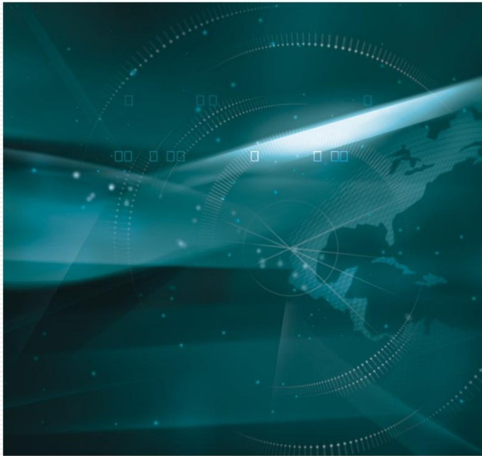
BS/2 Support and Maintenance